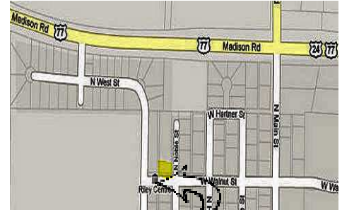
Riley Centre location

The next District 17-I convention will be on March 3, 2012 only. We are having a one day only convention so that all can get a condensed version and be home in one day.