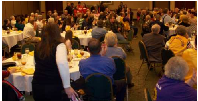
The Leos were again one of the highlights of our MWR. Members of several Leo clubs were present