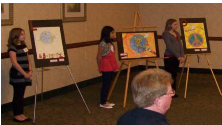
Peace Poster winners that were in attendance at the MWR were presented to the assembled Lions and guests.