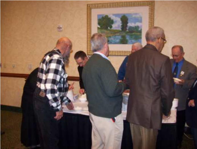
The registration desk was a busy place as the Rally got going. The crew working the desk were outstanding and took good care of our arriving Lions and friends.