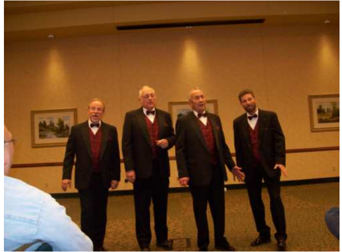
The luncheon crowd was treated to a performance with this performance by the Charades Barbershop Quartet from the Manhattan Barbershop Chorus.