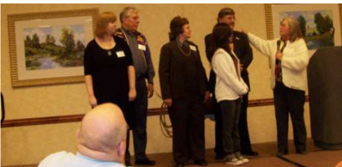
The attending participants of this years Youth exchange were introduced to our folks in attendance.